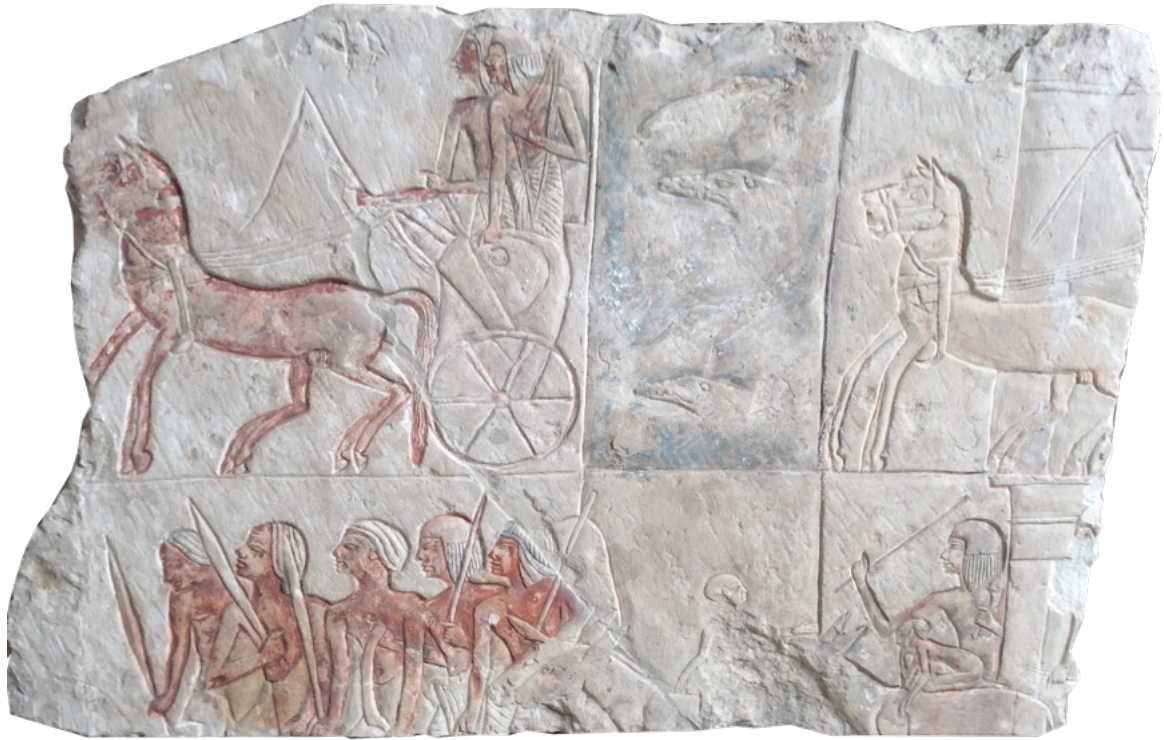
Fig.1a. The scene from Iwrkhy's tomb in Saqqara.