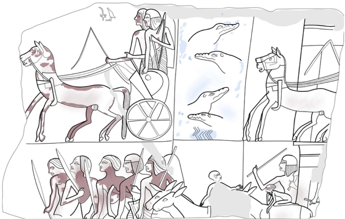
Fig. 1b. Facsimile of the scene [drawing by Nader el-Hassanein]