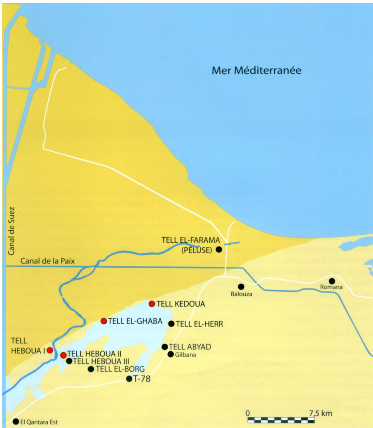
Fig. 3. The north-eastern Delta and North Sinai map showing the location of Tell Hebua I and II sites [A. MINAULT-GOUT, N. FAVRY, & N. LICITRA, Une résidence royale, Tell Abyad à l'époque ramesside , Paris, 2012 p. 12, fig. 3]

These sites were, during the New Kingdom, located at the mouth of the Pelusiac branch of the Nile and built to control the circulation of people and goods going out of or coming into Egypt – maybe taxes were also levied there on imported or exported goods. Moreover, the Egyptian armies used to gather there on their way to battle – Ramses II and his troops also passed the khetem of Tjaru on their way to Qadesh 14 . Thus, this khetem had important military and economic functions.